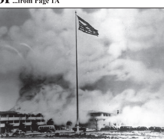
The U.S. Flag flies over Hickam Airfield after the attack on Pearl Harbor. Note the burning buildings in the background.

experience to see what the big city looked like and had to offer